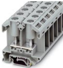
Universal terminal block with bolt connection, cross section: 1 - 25 mm 2 , width: 18 mm, color: gray

Please be informed that the data shown in this PDF Document is generated from our Online Catalog. Please find the complete data in the user's documentation. Our General Terms of Use for Downloads are valid ( http://download.phoenixcontact.com )