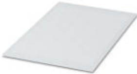
The figure shows a version of the article

Marker sheet, Din A4, white, Unlabeled, Can be labeled with: Plotter, Office printing systems, Mounting type: Adhesive, Lettering field: 296 x 210 mm