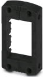
Sealing frame with screw locking, size B10, with flat gasket, for 6 small sleeves

Please be informed that the data shown in this PDF Document is generated from our Online Catalog. Please find the complete data in the user's documentation. Our General Terms of Use for Downloads are valid ( http://phoenixcontact.com/download )