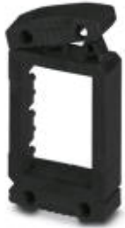
Sealing frame with locking latch, size B10, with flat gasket, for 6 small sleeves

Please be informed that the data shown in this PDF Document is generated from our Online Catalog. Please find the complete data in the user's documentation. Our General Terms of Use for Downloads are valid ( http://phoenixcontact.com/download )