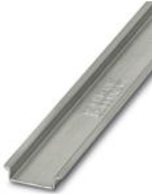
DIN rail, material: Steel, unperforated, height 7.5 mm, width 35 mm, length: 2 m

Please be informed that the data shown in this PDF Document is generated from our Online Catalog. Please find the complete data in the user's documentation. Our General Terms of Use for Downloads are valid ( http://phoenixcontact.com/download )