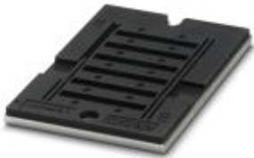
The figure shows version