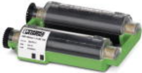
The figure shows version

Ink ribbon cartridge, for THERMOMARK PRIME for printing product groups US(2)-TM(F)..., US-TM(F)L..., US-WMTB..., US-EML..., US-EML(S)P..., US-EMLP-HA..., US-EM(S)P..., US-EML-RS..., Width: 110 mm, Color: white