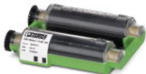
The figure shows version

Ink ribbon cartridge, for THERMOMARK PRIME for printing product groups US(2)-TM(F)..., US-TM(F)L..., US-WMTB..., US-EML..., US-EML(S)P..., US-EMLP-HA..., US-EM(S)P..., US-EML-RS..., Width: 110 mm, Color: red