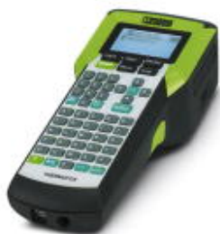
Portable thermal transfer printer for roll material

Please be informed that the data shown in this PDF Document is generated from our Online Catalog. Please find the complete data in the user's documentation. Our General Terms of Use for Downloads are valid ( http://phoenixcontact.com/download )