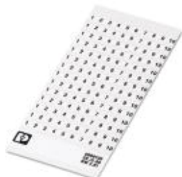
Marker card, self-adhesive, horizontally labeled with the consecutive numbers: 51 ... 60, 10-section marker strips with 14 identical decades, white

Please be informed that the data shown in this PDF Document is generated from our Online Catalog. Please find the complete data in the user's documentation. Our General Terms of Use for Downloads are valid ( http://phoenixcontact.com/download )