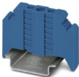
End clamp, width: 9.5 mm, height: 32.8 mm, material: PA, length: 48.6 mm, color: blue

Please be informed that the data shown in this PDF Document is generated from our Online Catalog. Please find the complete data in the user's documentation. Our General Terms of Use for Downloads are valid ( http://phoenixcontact.com/download )