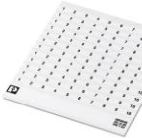
Marker card, self-adhesive, horizontally labeled with the consecutive numbers: 11 ... 20, 10-section marker strips with 12 identical decades, white

Please be informed that the data shown in this PDF Document is generated from our Online Catalog. Please find the complete data in the user's documentation. Our General Terms of Use for Downloads are valid ( http://phoenixcontact.com/download )