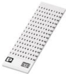
Marker cards, white, Mounting type: Adhesive, For terminal block width: 2.54 mm

Please be informed that the data shown in this PDF Document is generated from our Online Catalog. Please find the complete data in the user's documentation. Our General Terms of Use for Downloads are valid ( http://download.phoenixcontact.com )