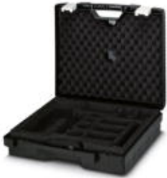
Hard-top case for storing the THERMOFOX printer and accessory parts

Please be informed that the data shown in this PDF Document is generated from our Online Catalog. Please find the complete data in the user's documentation. Our General Terms of Use for Downloads are valid ( http://phoenixcontact.com/download )