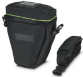
Shoulder bag for storing the THERMOFOX printer and accessory parts

Please be informed that the data shown in this PDF Document is generated from our Online Catalog. Please find the complete data in the user's documentation. Our General Terms of Use for Downloads are valid ( http://phoenixcontact.com/download )