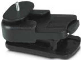
Belt clip for fastening the THERMOFOX printer

Please be informed that the data shown in this PDF Document is generated from our Online Catalog. Please find the complete data in the user's documentation. Our General Terms of Use for Downloads are valid ( http://phoenixcontact.com/download )