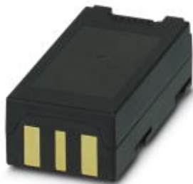
Rechargeable battery for operating the THERMOFOX printer

Please be informed that the data shown in this PDF Document is generated from our Online Catalog. Please find the complete data in the user's documentation. Our General Terms of Use for Downloads are valid ( http://phoenixcontact.com/download )