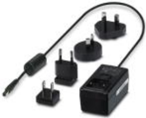
Power supply unit for operating the THERMOFOX printer

Please be informed that the data shown in this PDF Document is generated from our Online Catalog. Please find the complete data in the user's documentation. Our General Terms of Use for Downloads are valid ( http://phoenixcontact.com/download )