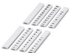
Zack marker strip flat, 10-section, horizontally labeled with the consecutive numbers: 71 ... 80, white

Please be informed that the data shown in this PDF Document is generated from our Online Catalog. Please find the complete data in the user's documentation. Our General Terms of Use for Downloads are valid ( http://phoenixcontact.com/download )