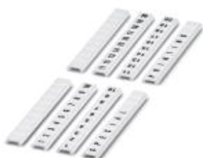
Zack marker strip flat, 10-section, horizontally labeled with the consecutive numbers: 81 ... 90, white

Please be informed that the data shown in this PDF Document is generated from our Online Catalog. Please find the complete data in the user's documentation. Our General Terms of Use for Downloads are valid ( http://phoenixcontact.com/download )