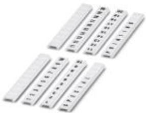
Zack marker strip flat, 10-section, horizontally labeled with the consecutive numbers: 91 ... 100, white

Please be informed that the data shown in this PDF Document is generated from our Online Catalog. Please find the complete data in the user's documentation. Our General Terms of Use for Downloads are valid ( http://phoenixcontact.com/download )