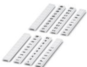
Zack marker strip flat, 10-section, horizontally labeled with the consecutive numbers: 131 ... 140, white

Please be informed that the data shown in this PDF Document is generated from our Online Catalog. Please find the complete data in the user's documentation. Our General Terms of Use for Downloads are valid ( http://phoenixcontact.com/download )