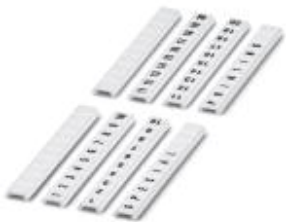
Zack marker strip flat, 10-section, horizontally labeled with the consecutive numbers: 151 ... 160, white

Please be informed that the data shown in this PDF Document is generated from our Online Catalog. Please find the complete data in the user's documentation. Our General Terms of Use for Downloads are valid ( http://phoenixcontact.com/download )