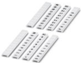
Zack marker strip flat, 10-section, vertically labeled with the consecutive numbers: 81 ... 90, white

Please be informed that the data shown in this PDF Document is generated from our Online Catalog. Please find the complete data in the user's documentation. Our General Terms of Use for Downloads are valid ( http://phoenixcontact.com/download )