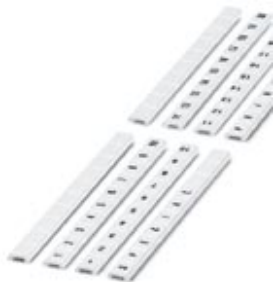
Zack marker strip flat, 10-section, horizontally labeled with the consecutive numbers: 21 ... 30, white

Please be informed that the data shown in this PDF Document is generated from our Online Catalog. Please find the complete data in the user's documentation. Our General Terms of Use for Downloads are valid ( http://phoenixcontact.com/download )