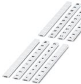
Zack marker strip flat, 10-section, horizontally labeled with the consecutive numbers: 31 ... 40, white

Please be informed that the data shown in this PDF Document is generated from our Online Catalog. Please find the complete data in the user's documentation. Our General Terms of Use for Downloads are valid ( http://phoenixcontact.com/download )