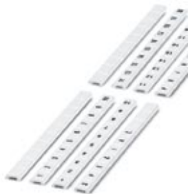
Zack marker strip flat, 10-section, horizontally labeled with the consecutive numbers: 41 ... 50, white

Please be informed that the data shown in this PDF Document is generated from our Online Catalog. Please find the complete data in the user's documentation. Our General Terms of Use for Downloads are valid ( http://phoenixcontact.com/download )