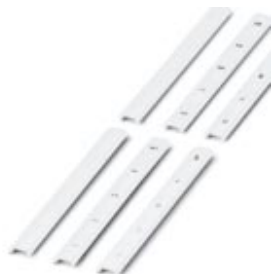
Zack marker strip, 10-section, horizontally labeled with the consecutive numbers: 1 ... 10, white

Please be informed that the data shown in this PDF Document is generated from our Online Catalog. Please find the complete data in the user's documentation. Our General Terms of Use for Downloads are valid ( http://phoenixcontact.com/download )