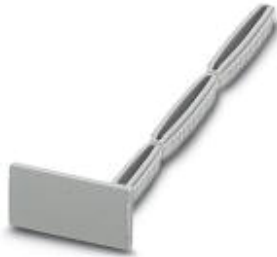
Terminal strip marker carrier, height-adjustable, for end brackets CLIPFIX 15, CLIPFIX 35 and CLIPFIX 35-5, can be labeled with BMK...20 x 8 labels, or directly with the M-PEN or X-PEN

Please be informed that the data shown in this PDF Document is generated from our Online Catalog. Please find the complete data in the user's documentation. Our General Terms of Use for Downloads are valid ( http://download.phoenixcontact.com )