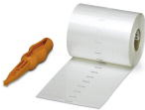
The figure shows the TMT 8 R version

Please be informed that the data shown in this PDF Document is generated from our Online Catalog. Please find the complete data in the user's documentation. Our General Terms of Use for Downloads are valid ( http://download.phoenixcontact.com )