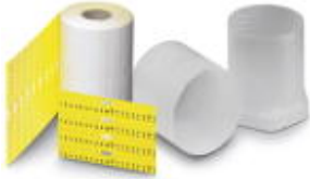
Illustration shows the product TMT 4 R YE

Marker for terminal blocks, can be ordered: By line, white, labeled according to customer specifications, Mounting type: Snap into universal marker groove, Snap into flat marker groove, for terminal block width: 6.2 mm, Lettering field: 6.35 x 6.15 mm