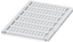
The figure shows the UCT2-TM 5/6 version

Marker for terminal blocks, can be ordered: by sheet, white, labeled according to customer specifications, Mounting type: Snap into tall marker groove, for terminal block width: 5.2 mm, Lettering field: 4.2 x 8.4 mm