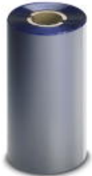
Ink ribbon, Length: 300000 mm, Width: 110 mm, Color: blue

Please be informed that the data shown in this PDF Document is generated from our Online Catalog. Please find the complete data in the user's documentation. Our General Terms of Use for Downloads are valid ( http://download.phoenixcontact.com )