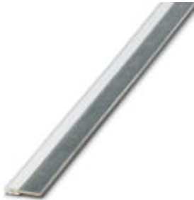
Continuous plug-in bridge, length: 500 mm, number of positions: 1, color: gray

Please be informed that the data shown in this PDF Document is generated from our Online Catalog. Please find the complete data in the user's documentation. Our General Terms of Use for Downloads are valid ( http://phoenixcontact.com/download )