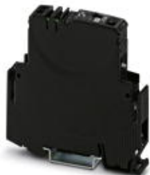
Electronic circuit breaker, signal contact: 1 N/C contact, nominal current: 10 A

Please be informed that the data shown in this PDF Document is generated from our Online Catalog. Please find the complete data in the user's documentation. Our General Terms of Use for Downloads are valid ( http://phoenixcontact.com/download )