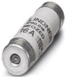
Fuse insert, Nominal current: 16 A, Length: 10 mm, Width: 10 mm, Color: gray

Please be informed that the data shown in this PDF Document is generated from our Online Catalog. Please find the complete data in the user's documentation. Our General Terms of Use for Downloads are valid ( http://download.phoenixcontact.com )