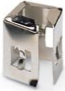
NEOZED special spring, for using fuse inserts D 01, in threaded caps D 02, for 2 A ... 16 A

Please be informed that the data shown in this PDF Document is generated from our Online Catalog. Please find the complete data in the user's documentation. Our General Terms of Use for Downloads are valid ( http://download.phoenixcontact.com )