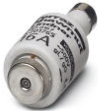
Fuse insert, Nominal current: 10 A, Length: 10 mm, Width: 10 mm, Color: red

Please be informed that the data shown in this PDF Document is generated from our Online Catalog. Please find the complete data in the user's documentation. Our General Terms of Use for Downloads are valid ( http://download.phoenixcontact.com )