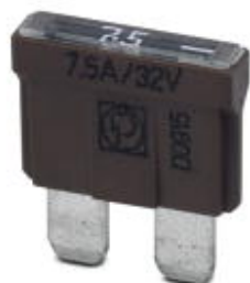
Flat-type plug-in fuse, type C, color code: brown, nominal current: 7.5 A

Please be informed that the data shown in this PDF Document is generated from our Online Catalog. Please find the complete data in the user's documentation. Our General Terms of Use for Downloads are valid ( http://phoenixcontact.com/download )