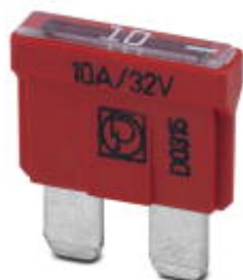
Flat-type plug-in fuse, type C, color code: red, nominal current: 10 A

Please be informed that the data shown in this PDF Document is generated from our Online Catalog. Please find the complete data in the user's documentation. Our General Terms of Use for Downloads are valid ( http://phoenixcontact.com/download )