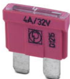
Flat-type plug-in fuse, type C, color code: pink, nominal current: 4 A

Please be informed that the data shown in this PDF Document is generated from our Online Catalog. Please find the complete data in the user's documentation. Our General Terms of Use for Downloads are valid ( http://phoenixcontact.com/download )