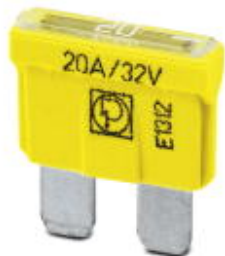
Flat-type plug-in fuse, type C, color code: yellow, nominal current: 20 A

Please be informed that the data shown in this PDF Document is generated from our Online Catalog. Please find the complete data in the user's documentation. Our General Terms of Use for Downloads are valid ( http://phoenixcontact.com/download )