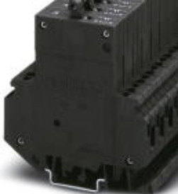
Thermomagnetic circuit breaker, 1-pos., normal blow, 1 N/O contact, with universal foot for mounting on NS 32 or NS 35

Please be informed that the data shown in this PDF Document is generated from our Online Catalog. Please find the complete data in the user's documentation. Our General Terms of Use for Downloads are valid ( http://download.phoenixcontact.com )