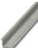
DIN rail, material: Steel, unperforated, 2.3 mm thick, height 15 mm, width 35 mm, length: 2 m

DIN rail - NS 35/15-2,3 UNPERF 2000MM - 1201798