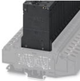
Thermomagnetic circuit breaker, 2-pos., normal blow, 1 N/O contact and 1 N/C contact

Please be informed that the data shown in this PDF Document is generated from our Online Catalog. Please find the complete data in the user's documentation. Our General Terms of Use for Downloads are valid ( http://phoenixcontact.com/download )