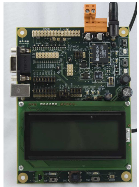
FT 5000 EVB Evaluation Board

Two FT 5000 EVB Evaluation Boards are included with the NodeBuilder FX/FT Development Tool and the NodeBuilder FX/FT Classroom Edition. The FT 5000 EVB is a complete Series 5000 LonWorks device that you can use to evaluate the LonWorks 2.0 platform and create LonWorks 2.0 devices. The FT 5000 EVB includes an FT 5000 Smart Transceiver with an external 10MHz crystal (you can adjust the internal system clock speed from 5MHz to 80MHz), an FT-X3 communication transformer, 64KB external serial EEPROM and flash memory devices, and a 3.3V power source.