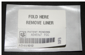
Remove label from liner