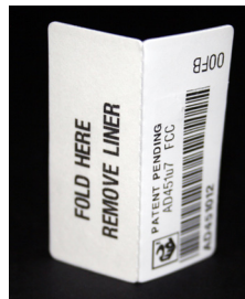
Fold label in half