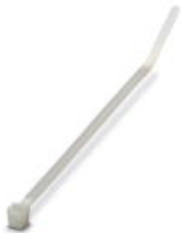
Cable tie, dimensions: L x W, 100 x 2.5 mm, color: transparent

Please be informed that the data shown in this PDF Document is generated from our Online Catalog. Please find the complete data in the user's documentation. Our General Terms of Use for Downloads are valid ( http://download.phoenixcontact.com )