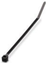
Cable tie, resistant to UV rays, dimensions: L x W, 290 x 4.8 mm, color: black

Please be informed that the data shown in this PDF Document is generated from our Online Catalog. Please find the complete data in the user's documentation. Our General Terms of Use for Downloads are valid ( http://download.phoenixcontact.com )