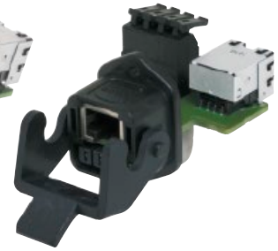
Han® 3 A, Hybrid, components device side panel feed-throughs